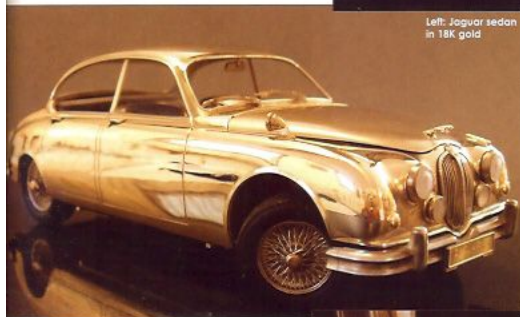
Left: Jaguar sedan in 18K gold

"My first model car, however, you will still find in the boardroom of DaimlerChrysler in Stuttgart..."