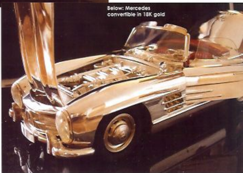
Below: Mercedes convertible in 18K gold

For car buffs and collectors, these German-made precision masterpieces are the ultimate collectible.